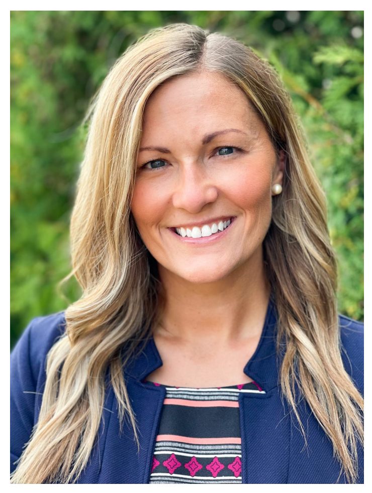
Greetings, Watertown friends, family, and colleagues,

I am pleased to present to you our 2022 City of Watertown Annual Report!